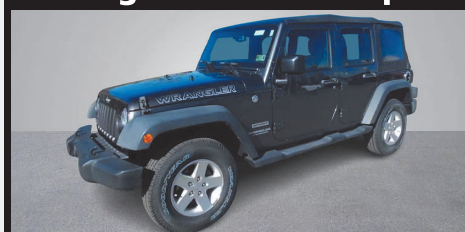
2017 Jeep Wrangler Unlimited Sport