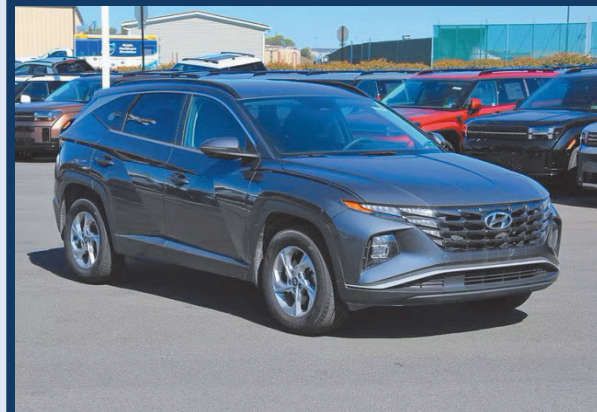
2022 Hyundai TUCSON SEL