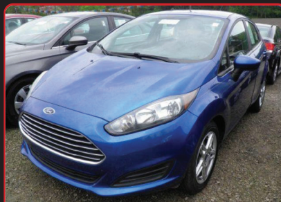
2019 FORD FIESTA 1.6 L • AT • PW • PL stk #23720