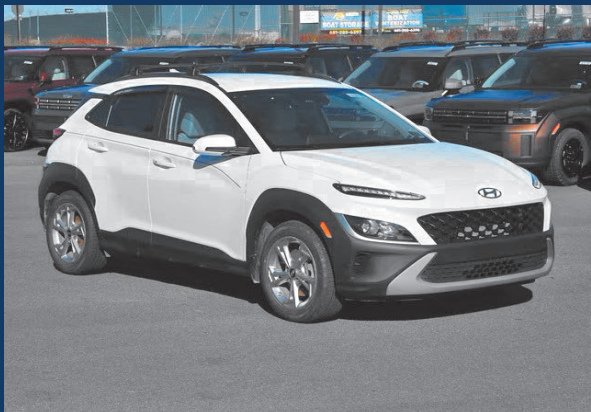
2022 Hyundai KONA SEL