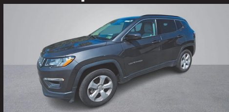
2021 Jeep Compass Latitude