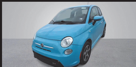
2017 Fiat 500e 2 Dr Hatchback