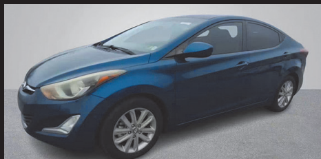
2016 Hyundai Elantra SE