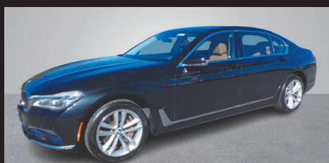
2016 BMW 7 Series 750i xDrive