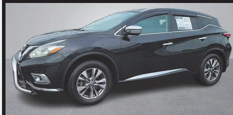
2015 Nissan Murano SL