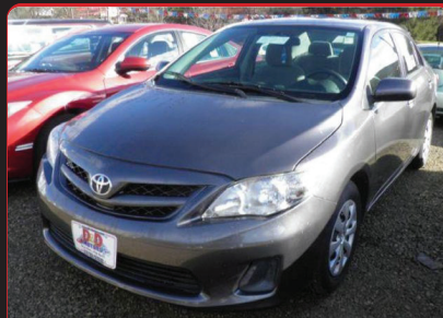
2011 TOYOTA COROLLA 1.8 L • AT • PW • PL stk# 22448