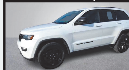
2019 Jeep Grand Cherokee Upland E