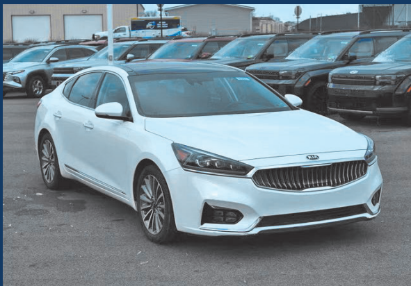
2017 Kia CADENZA Technology