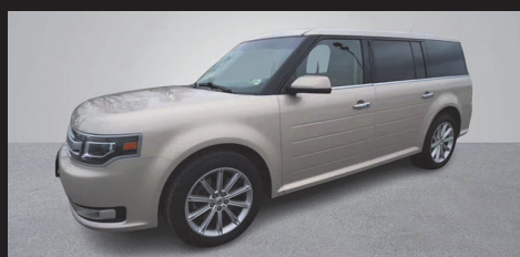
2018 Ford Flex Limited