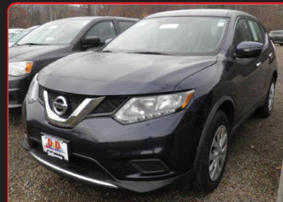
2015 NISSAN ROGUE 2.5 L • CVT • AWD • PW • PL • BT stk# 24604

CALL 301-463-2404 for a SALES APPOINTMENT!