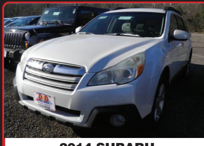
2014 SUBARU OUTBACK 2.5L • 6-SPD. • AWD • HTD SEATS PW • PL • BT stk# 24986