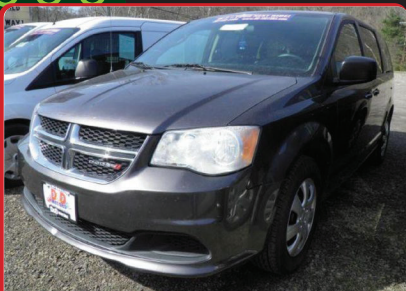
2018 DODGE CARAVAN 3.6 L • AT • PW • PL • BT • 7-PASS. stk# 23258