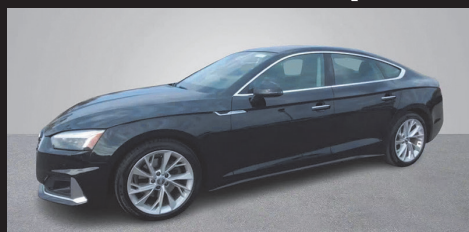
2021 Audi A5 40 Premium Plus Quattro