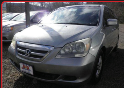
2007 HONDA ODYSSEY 3.5 L • AT • PW • PL • 8-PASS. stk# 21580X