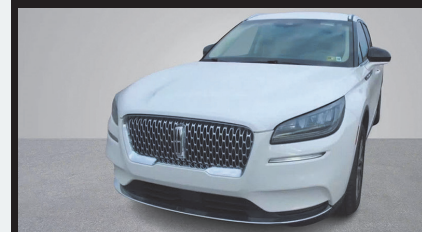
2022 Lincoln Corsair Standard