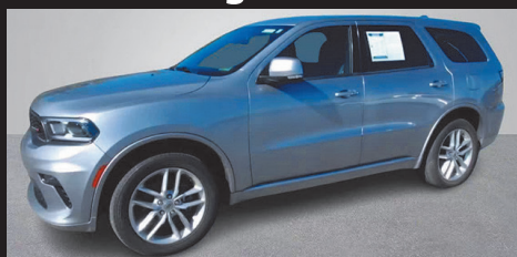
2021 Dodge Durango GT Plus