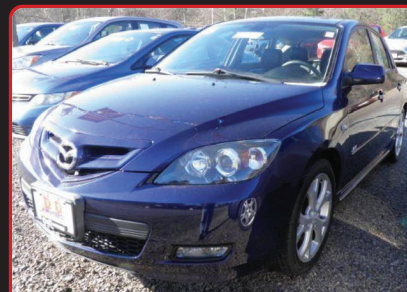
2008 MAZDA MAZDA3 2.3 L • Sunroof • PW • PL • HTD SEATS stk #24704