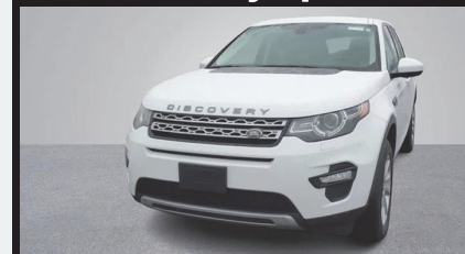
2016 Land Rover Discovery Sport HSE