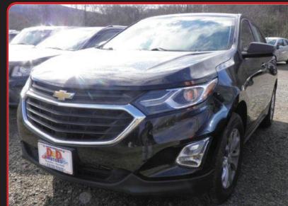
2020 CHEVY EQUINOX 1.5 L • AT • BT • PW • PL stk# 24628