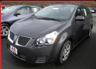
2009 PONTIAC VIBE 2.4 L • AT • PW • PL stk# 22014