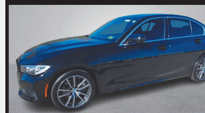
2019 BMW 3 Series 330i xDrive