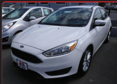
2016 FORD FOCUS 2.0 L • AT • BT • Sunroof • PW • PL stk #20462