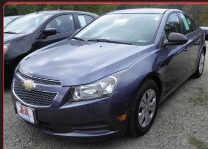
2014 CHEVY CRUZE 1.8L Turbo, AT, PW, PL stk# 24418