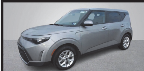
2023 Kia Soul LX