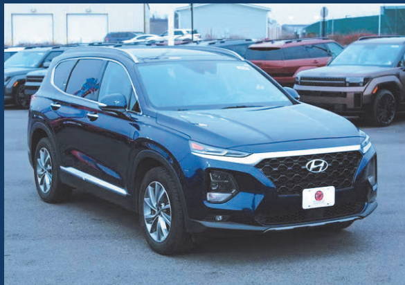
2019 Hyundai SANTA Fe Ultimate