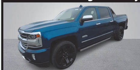
2017 Chevy Silverado 1500 High Country