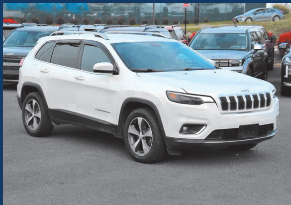
2019 Jeep CHEROKEE Limited