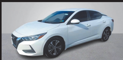
2021 Nissan Sentra SV