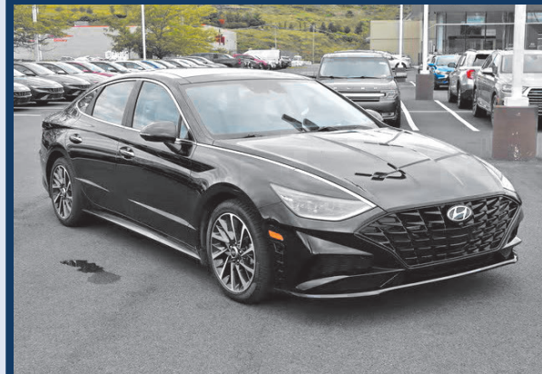
2023 Hyundai SONATA Limited