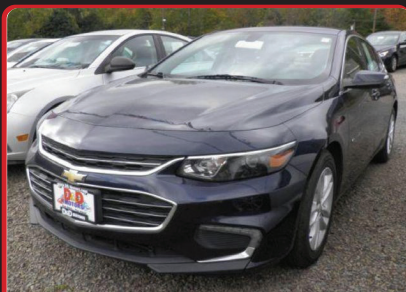
2018 CHEVY MALIBU 1.5 L • AT • Sunroof • PW • PL stk #24580